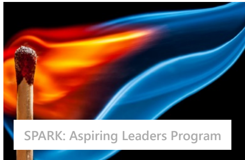
SPARK: Aspiring Leaders Program