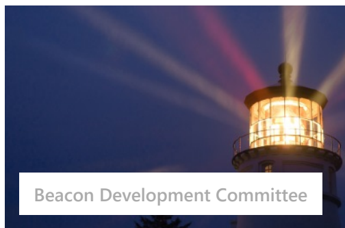
Beacon Development Committee