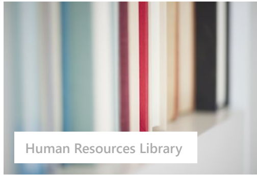
Human Resources Library