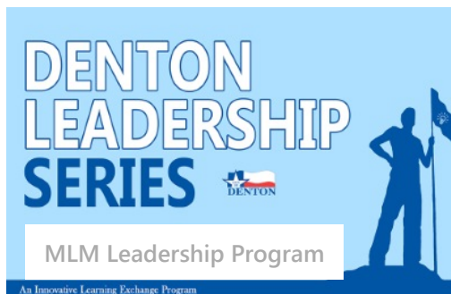
MLM Leadership Program