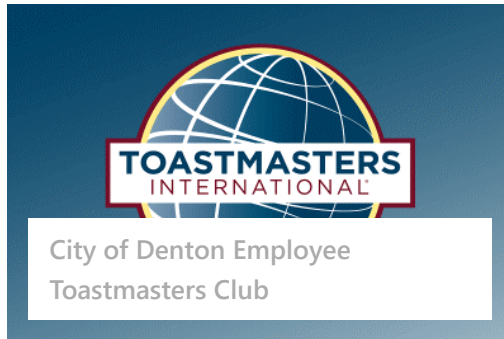
City of Denton Employee Toastmasters Club