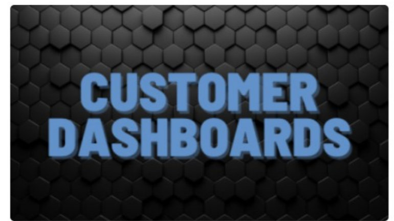
Vehicle & Project Information