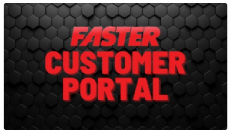
Service, PM, & Inspection Requests