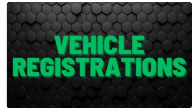
Ready for Pick Up & Upcoming